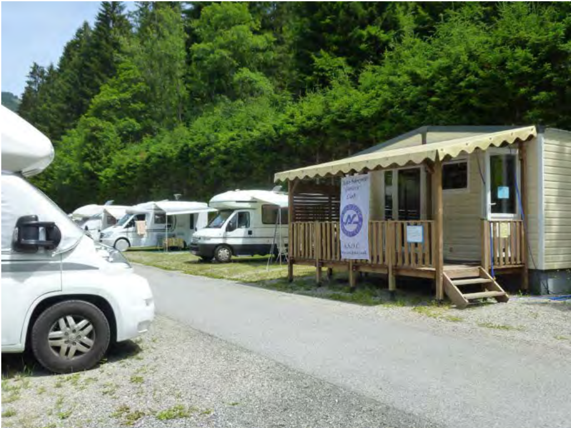
Our private terrace at Camping l'Escale