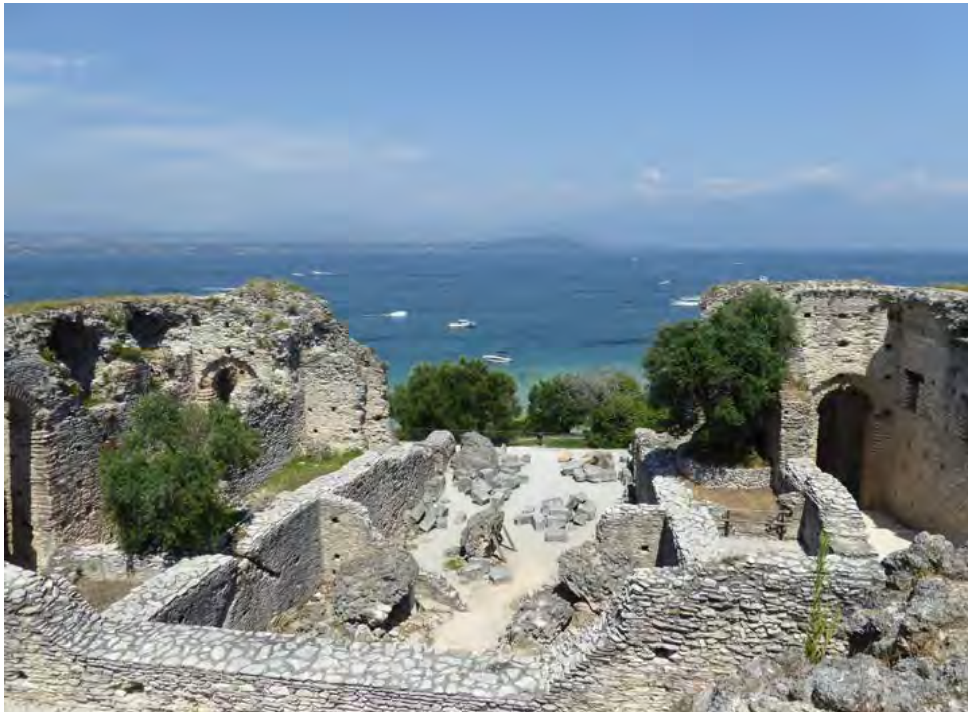
Roman ruins at Simeone del Garda