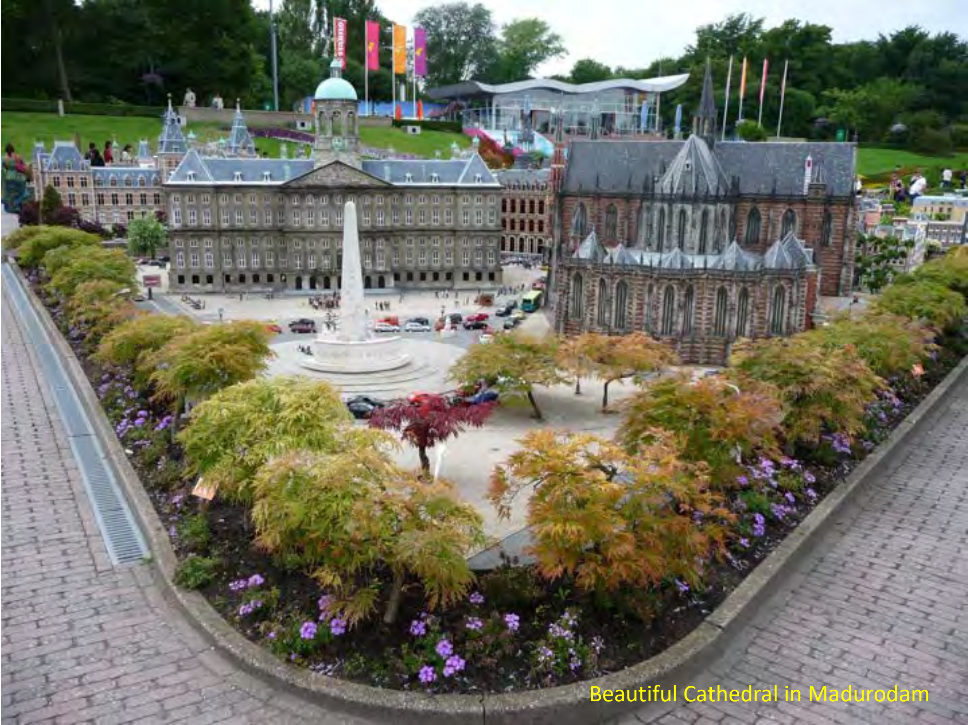
Beautiful Cathedral in Madurodam