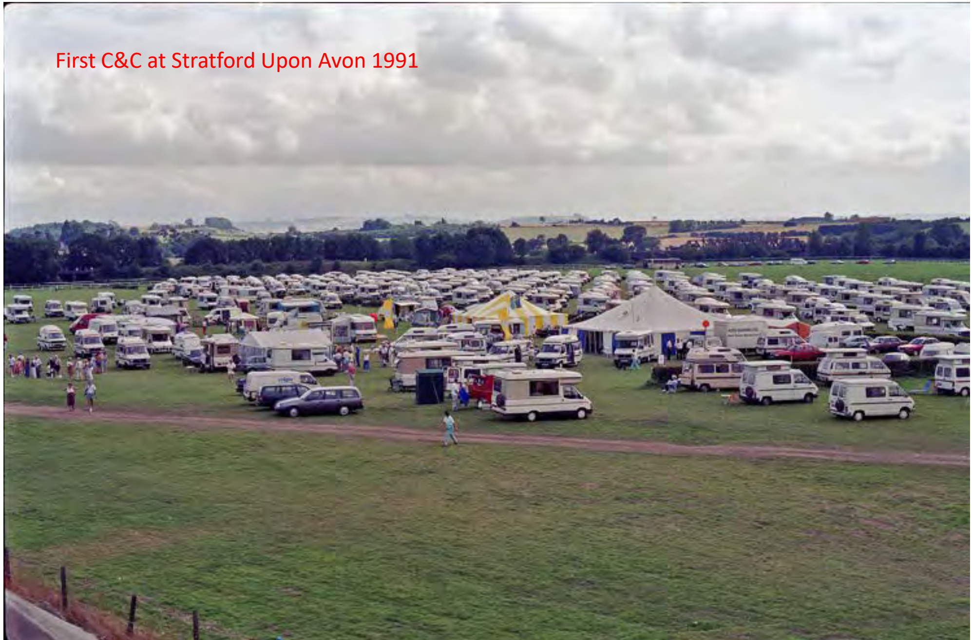
First C&C at Stratford Upon Avon 1991