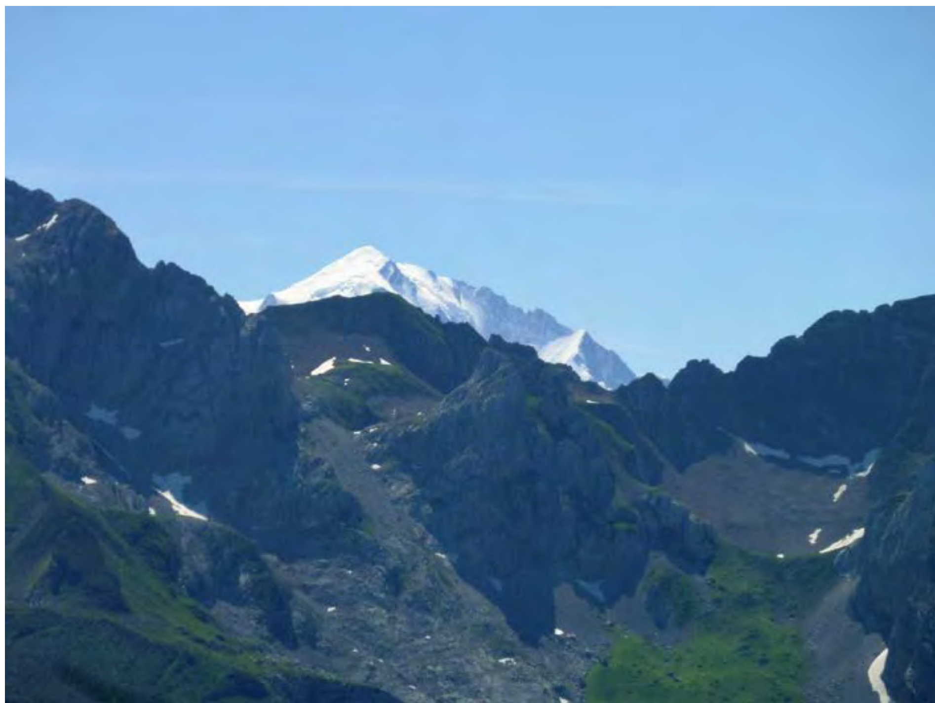
Looking towards Mont Blanc