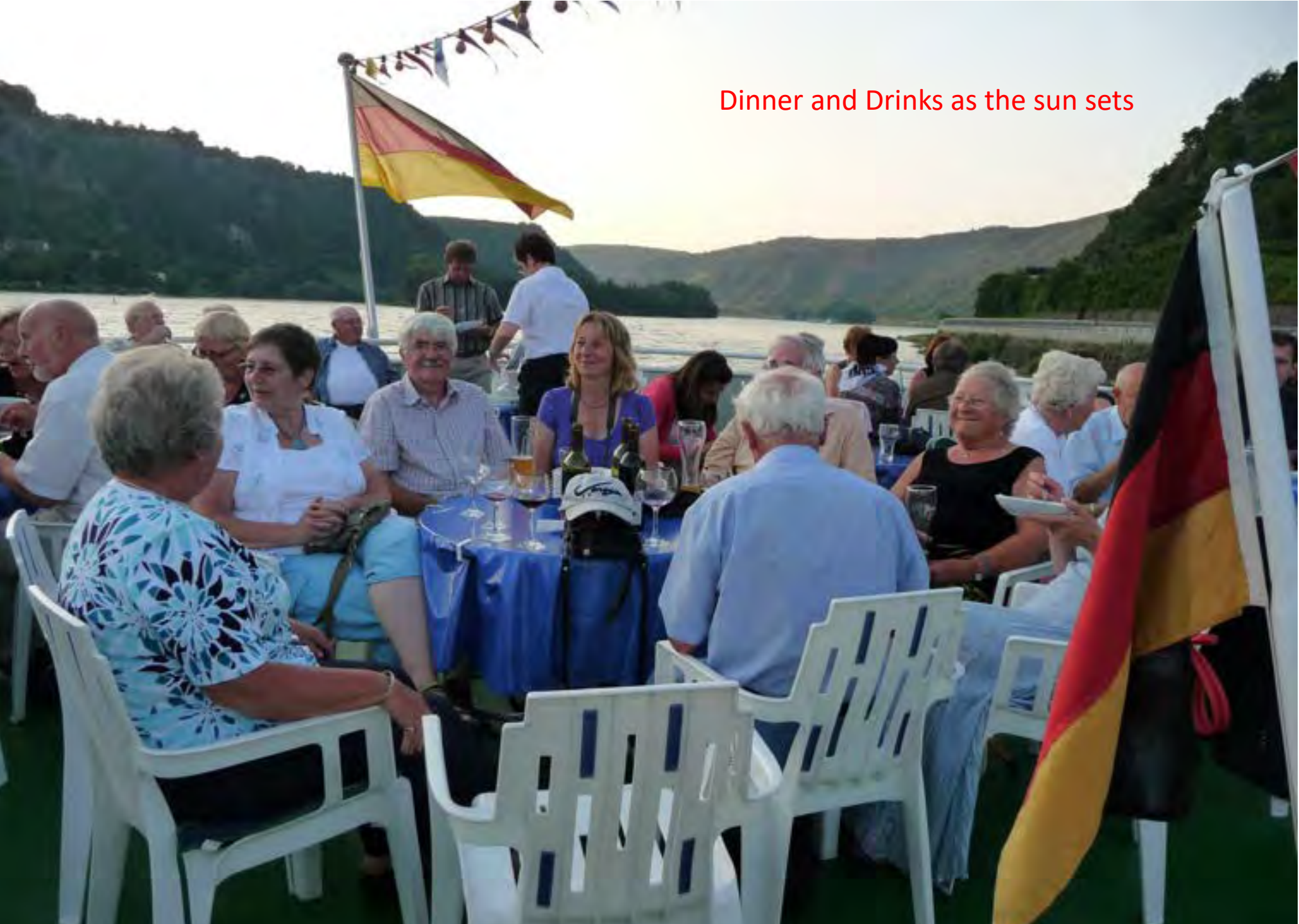
Dinner and Drinks as the sun sets