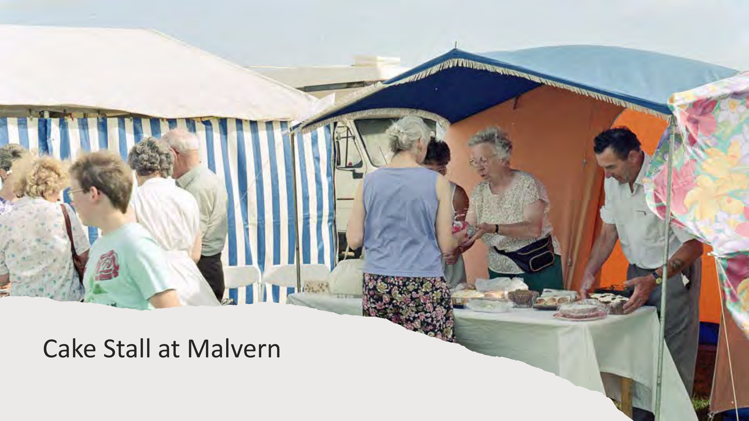
Cake Stall at Malvern