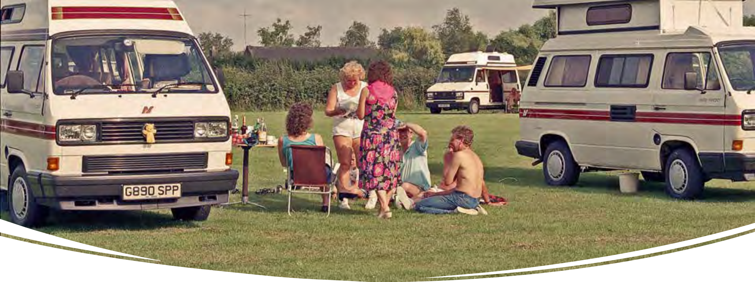
Enjoying the sun at the Walsall Rally 1991