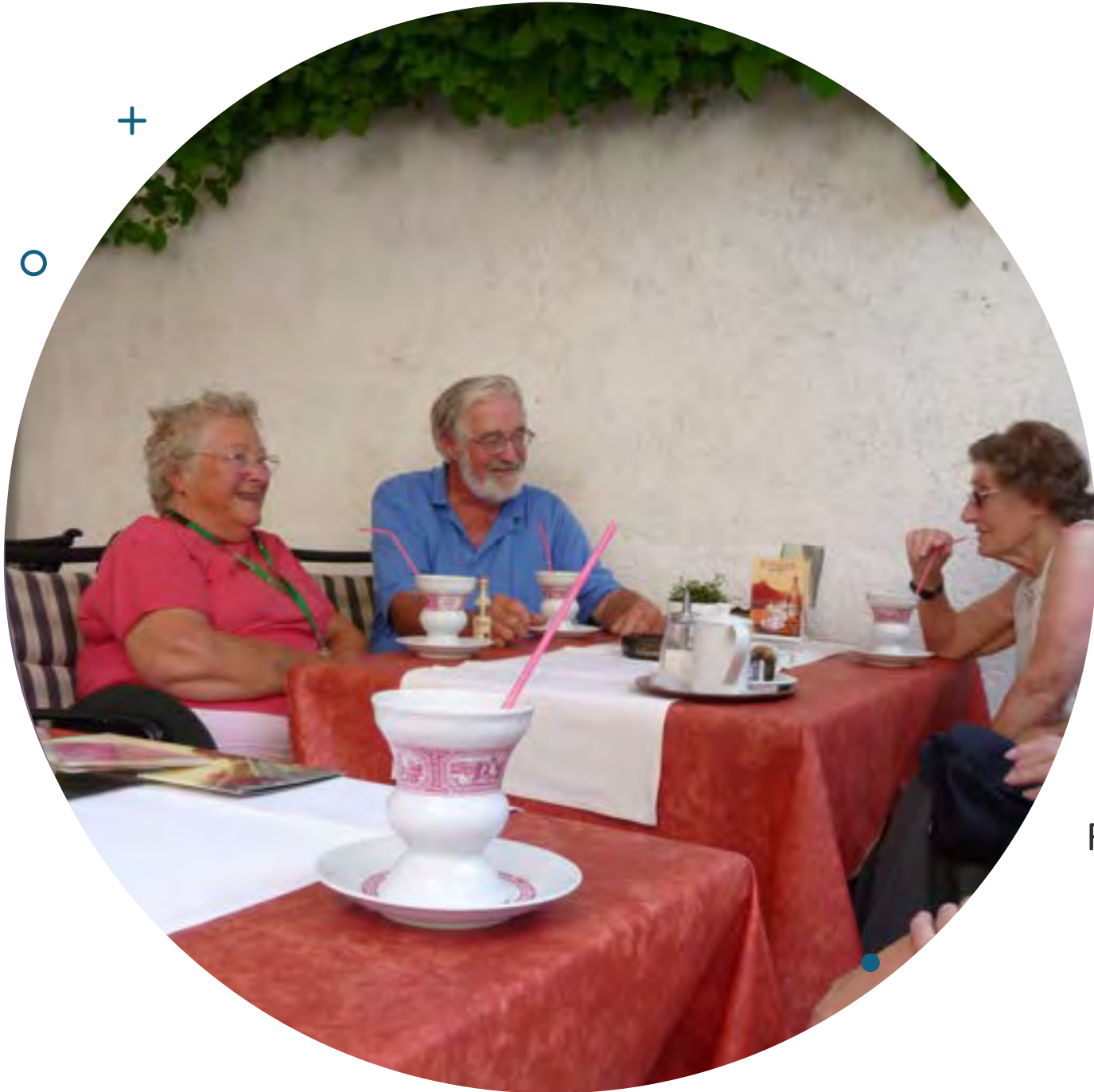
Relaxing in a favorite haunt