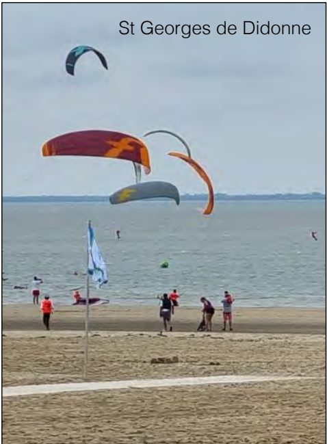
St Georges de Didonne