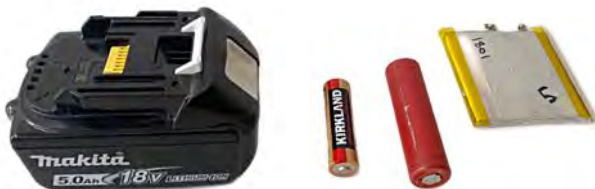
Left to right: Lithium-ion battery pack – Standard AA zinc-carbon cell Lithium-ion 18650 cell – Lithium-ion-Polymer (LiPO) cell

None of the above cells / batteries are used in leisure batteries and are shown to illustrate the various battery technologies and styles in common use.