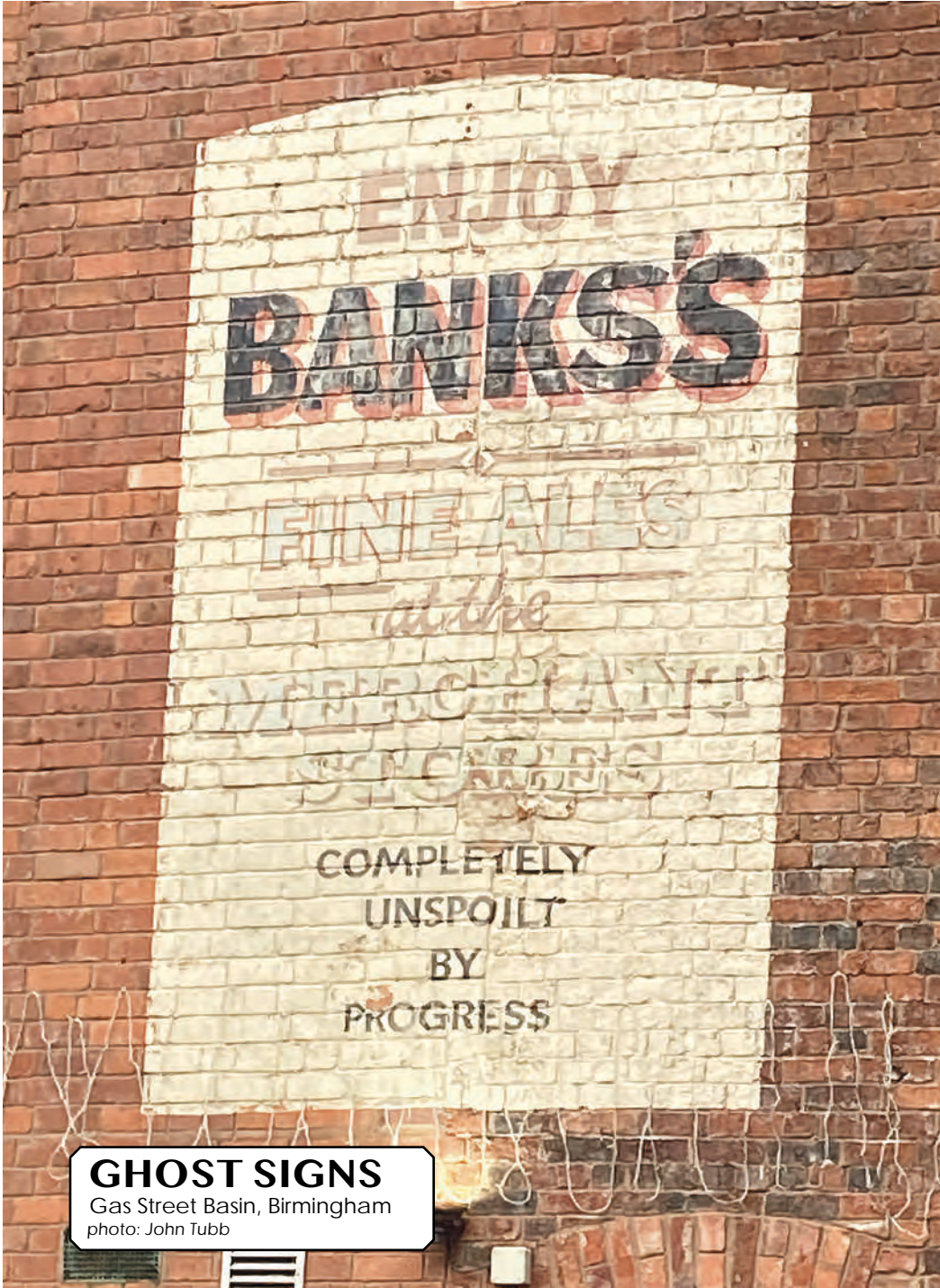
GHOST SIGNS Gas Street Basin, Birmingham