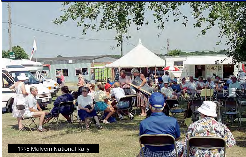
1995 Malvern National Rally