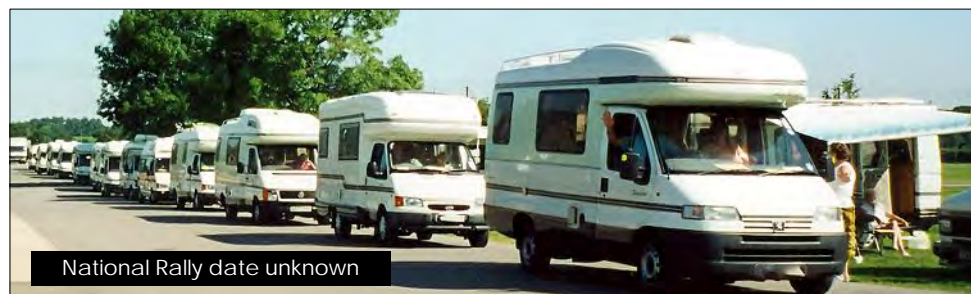
National Rally date unknown