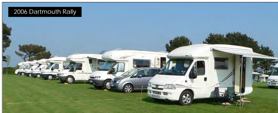
2006 Dartmouth Rally