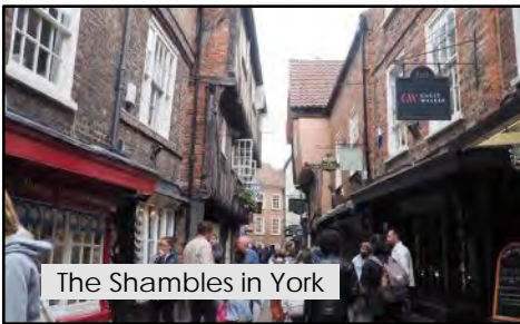
The Shambles in York