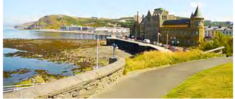
Aberystwyth Old College

woodland walks, but due to covid fewer people were allowed on the train and you could not stop as long at the terminus of Devils Bridge.