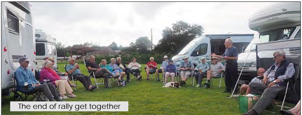
The end of rally get together

there is a bus stop just outside the club grounds which takes you into York City Centre.