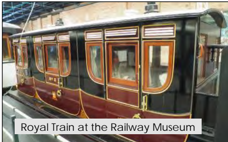
Royal Train at the Railway Museum