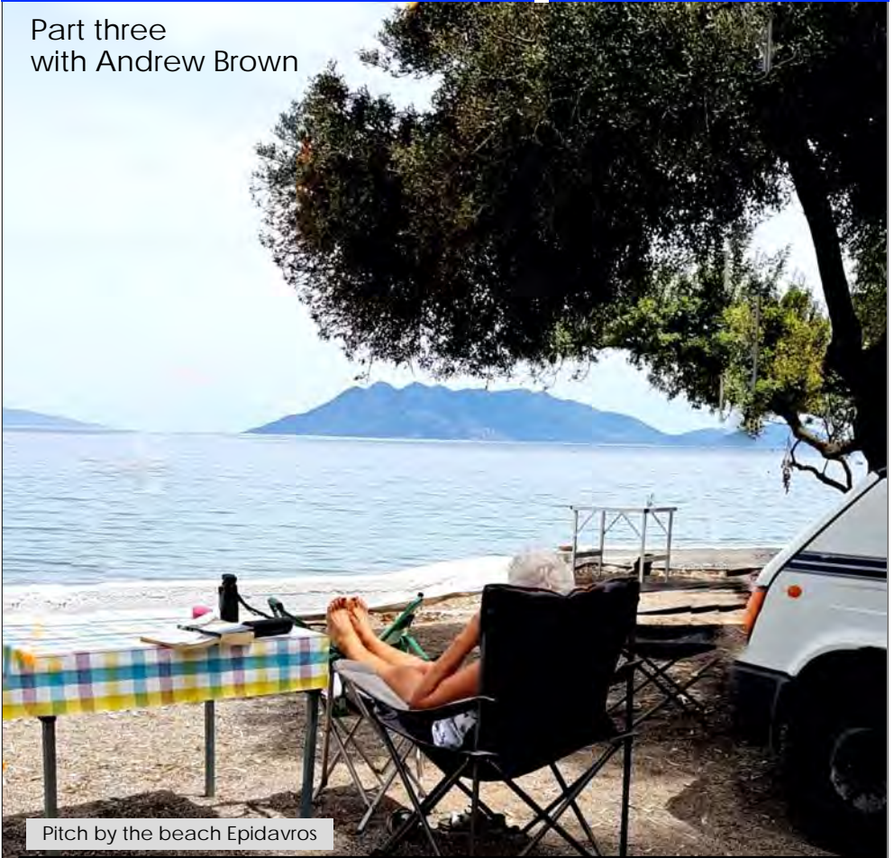
Pitch by the beach Epidavros

19th May and our return to the Greek mainland. We docked in Piraeus (Athens) at 11pm after a 12-hour crossing with no comfortable seating and no food. (Greek island ferries are basic!) The satnav took us through some tortuously narrow streets to the aire we had identified to spend the night, only to find that it was now the car park for the Spring fairground which the posters advised us was open until 2am! Heyho, a quick look at the map and we set off towards Corinth and found a peaceful motorway services to get our heads down and have a sleep. In the morning we set off early to meet up with friends at Epidavros, stopping to have breakfast on the beach at Limanaki.