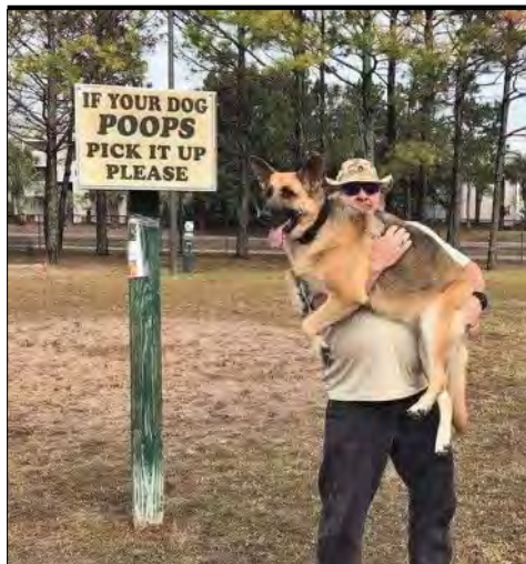
made me smile