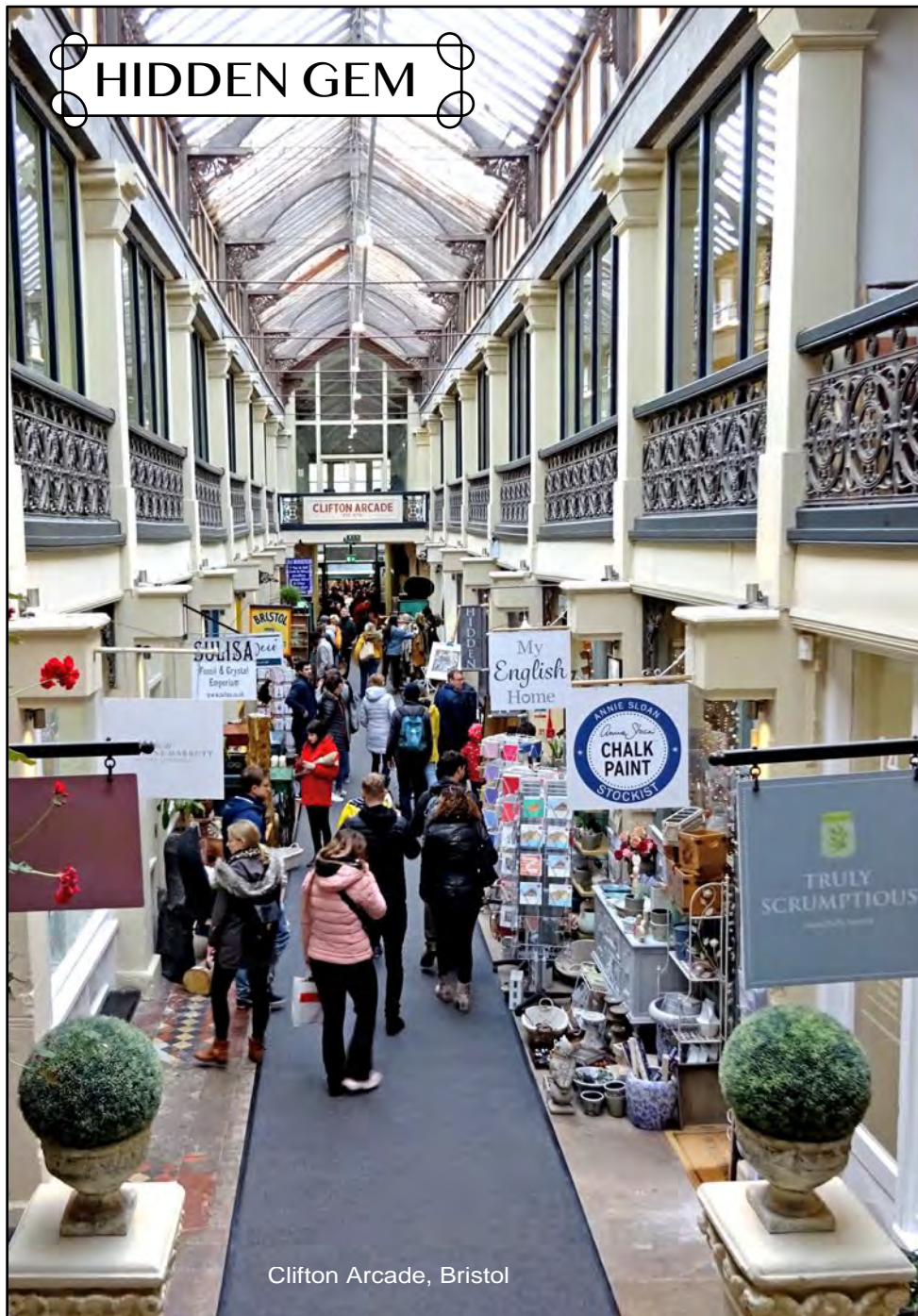
Clifton Arcade, Bristol