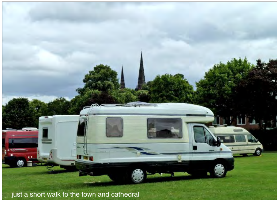
just a short walk to the town and cathedral

POSTCODE for Lower Sandford Street is WS13 6RA.