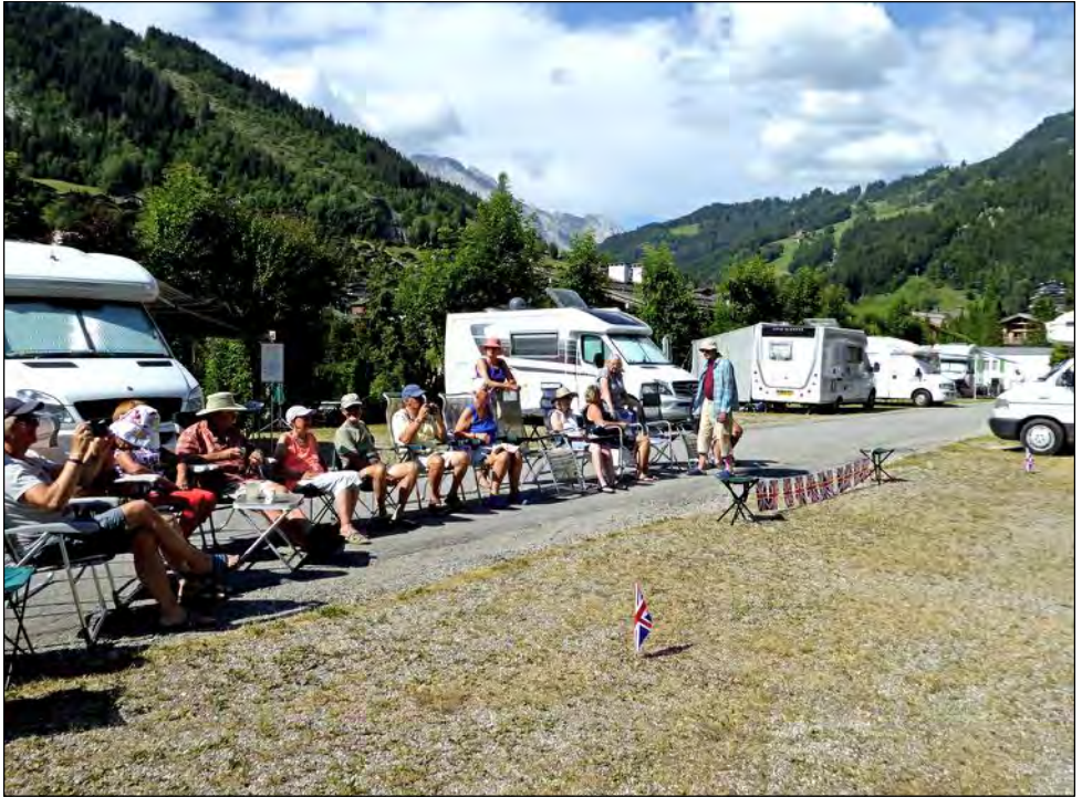
All set for the Boules Final