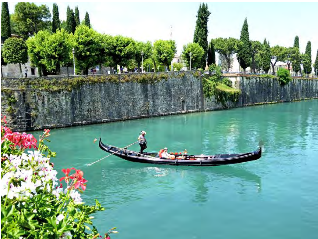
Gondola in Pecharia