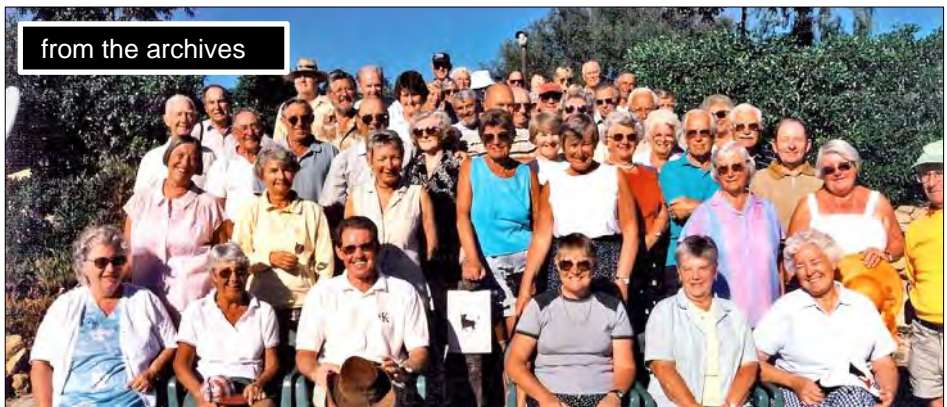
ASOC friends meet, Spain 2000

At the moment we have no marshals for this show rally. If we have no volunteers then there will be no official Club rally at the show. [rally coordinator]