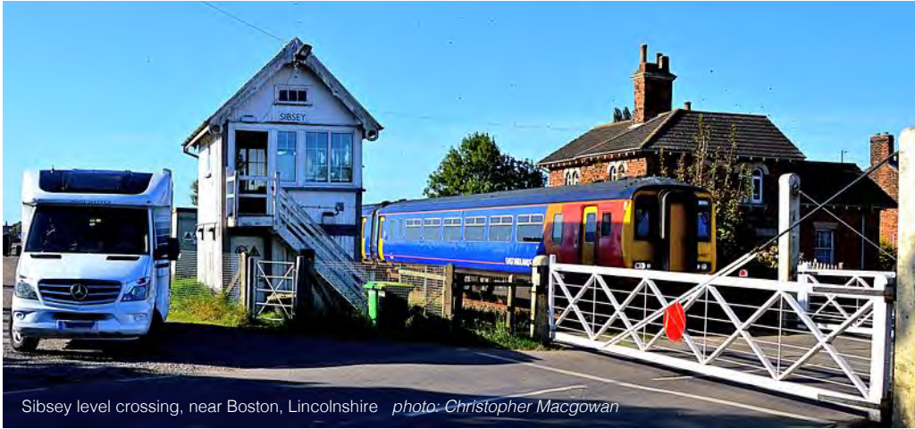
Sibsey level crossing, near Boston, Lincolnshire