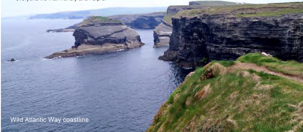
Wild Atlantic Way coastline