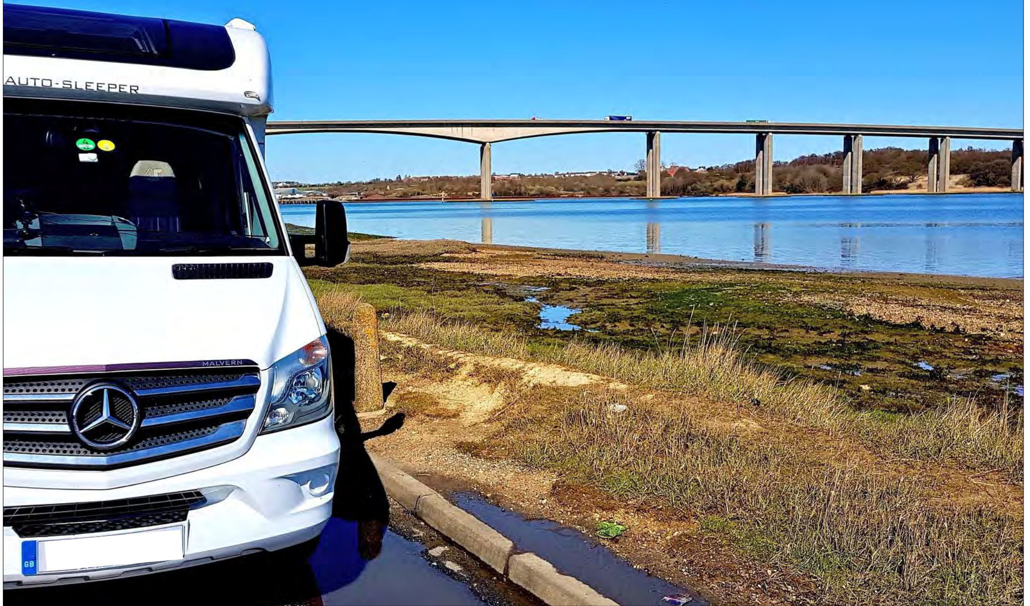
At the River Orwell in Suffolk "Spring has arrived"