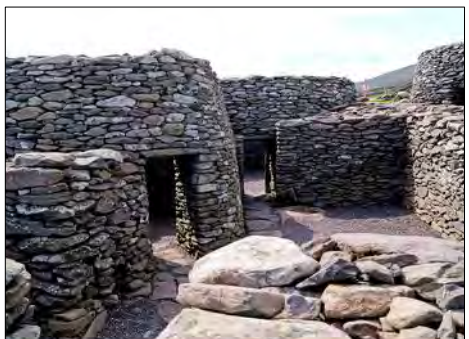
Famine Houses and Beehive Houses