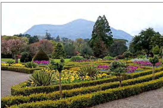
above: Muckross House and Gardens

followed by a nice walk around the gardens. Included in the ticket was admission to the four farm houses on the estate. The first was a small farm house with a few chickens and a donkey. The next house was for the farm labourers and only consisted of one large room for cooking and family use and one bedroom, with a small garden for vegetables. The third farmhouse was considered to be of “medium” size with room for chickens, pigs and outhouses. The fourth farmhouse was the “large” house and fully furnished with period furniture, a kitchen, dining room, bedrooms and living room all with polished wood floors. There were numerous outbuildings and a dairy. In one of the barns there were a number of pens where the children could see and touch a selection of small animals such as piglets, lambs, turkeys and even farm puppies. In another barn we saw a donkey, two shire horses and a very smart Jaunty Cart. We moved on to see the carpenters shop, saddle shop and forge, and the estate schoolroom. It was a good day out and we didn't get back to the site until late.