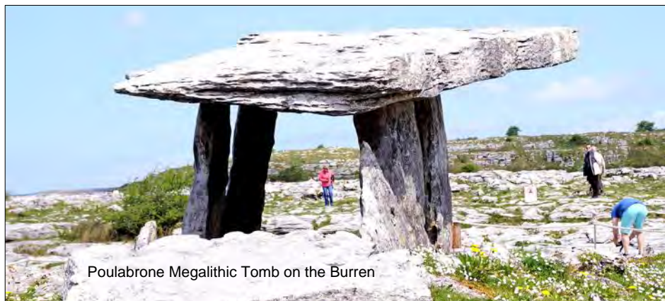
Poulabrone Megalithic Tomb on the Burren

SUNDAY 15 May: A quiet day today. Went for a stroll along the shoreline and then to the village for another pub lunch.