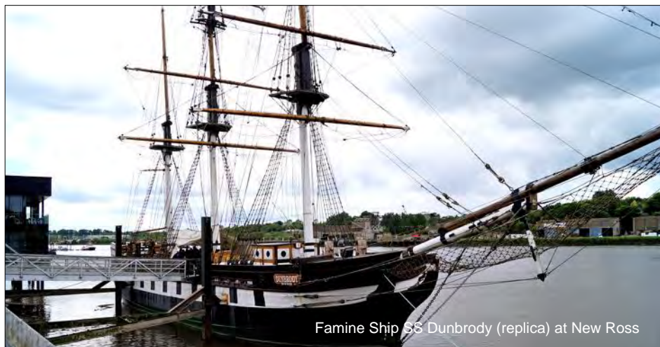
Famine Ship SS Dunbrody (replica) at New Ross

WEDNESDAY 18 May: We awoke to sun and continued our journey back through Caher, Clonmell, Waterford and New Ross stopping off whenever something took our interest. The most interesting was in New Ross where we visited the Dunbrody Centre and a replica of the SS Dunbrody. The Dunbrody was commissioned by William Graves and Sons of New Ross and was built in 1845 in Quebec, Canada, as a cargo ship. Two years later she was converted to carry passengers fleeing the Irish Potato Famine. In 1847 she is recorded as carrying 313 passengers to Quebec. New Ross in Co.Wexford is also the ancestral home of the US President John F Kennedy and a Trust was founded there in 1988 to support local projects. Amongst other projects the Trust has supported a database of Irish immigrants to the USA during the famine. We left the centre around 5pm and completed our run back to the campsite at St. Margarets.