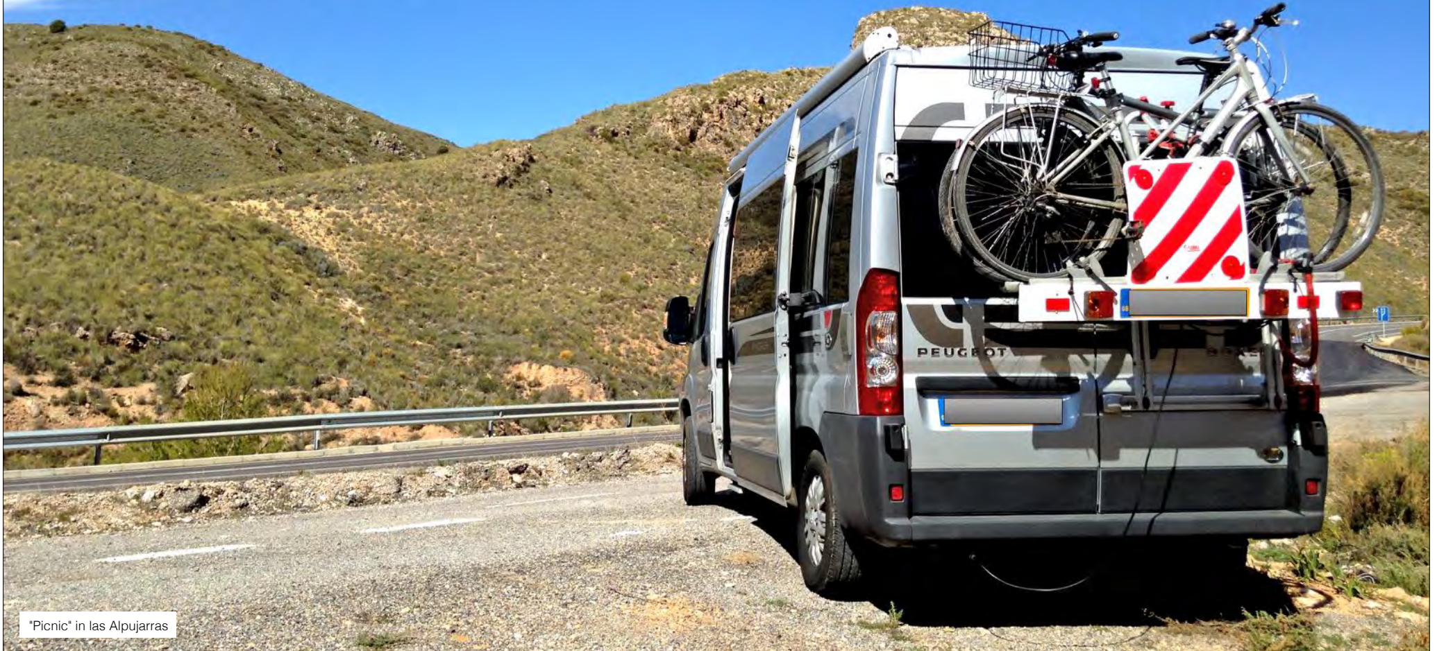
"Picnic" in las Alpujarras

A 24-hour Brittany Ferries crossing to Santander in February – sounds risky? But we were fortunate; the Bay of Biscay was as calm as a millpond. Friends had taunted us that there had been heavy snow in Northern Spain. True - the Picos d'Europa were looking beautifully snow-clad – but the roads were clear. The roads in Spain are wonderful. A huge amount of money has been spent on infrastructure generally. We saw many incomplete new roads, rail tracks and building sites – the money had clearly run out. ➡