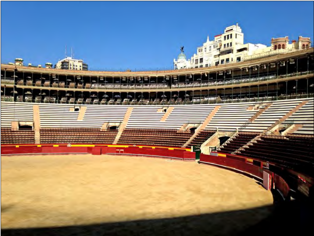
The bull ring in Valencia

Moving towards the Med coast near Valencia we started seeing the ubiquitous orange tree and olive grove. This was clearly the height of the citrus season with heavily-laden orange and