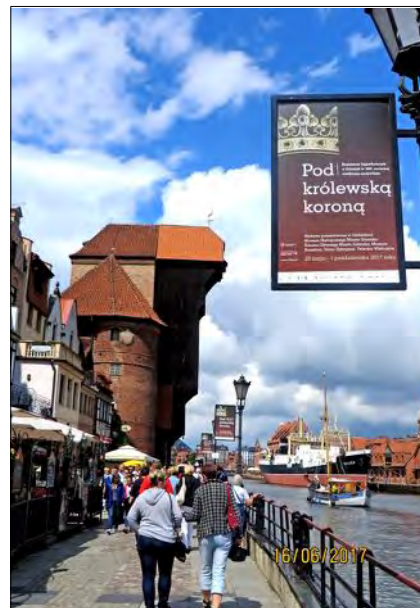
right: Gdansk wooden crane

We then returned to Sangatte for one night. On to one night stop at La Bien Assise prior to the morning shuttle and finally to home after travelling a total of 3312 miles.