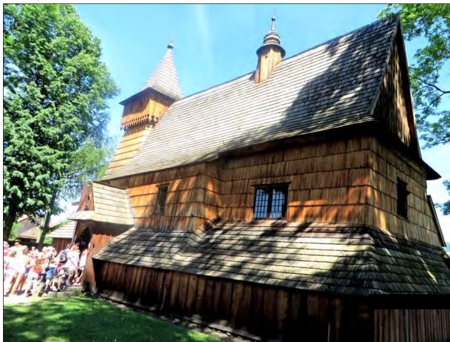
below: Debno UNESCO church

the next day. We booked before departing Smok which saved queuing. There are some things in the city, including the Rynek Underground which need advance booking the day before to get in.