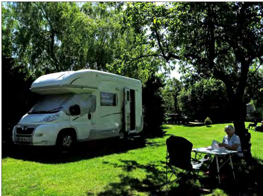
above: At Smok Camping

Krakow is a very pleasant and interesting city, needing time to explore and there are many tours. Restaurant meals were good, including those in the main square on a covered terrace. In the city we were able to pre-book an English speaking tour of the Wieliczka salt mine for