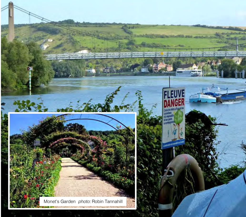
Monet's Garden