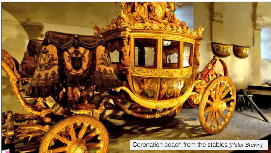
Coronation coach from the stables

And then – VERSAILLES. After booking in the campsite at 2pm (and there's another story!), we headed off on foot – about 2 miles across town. The Avenue de Paris is a wide boulevard flanked with some beautiful buildings, but the first sight of the Chateau is impressive. We arrived about 3.30pm and got through security quite easily, then walked up to what I thought was quite a long queue for the Chateau. However, they dealt with access very quickly and we were soon inside and the queue did give us the opportunity of studying the façade with all its gilding.