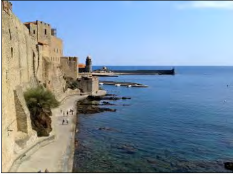
Collioure near Argelès-sur-Mer