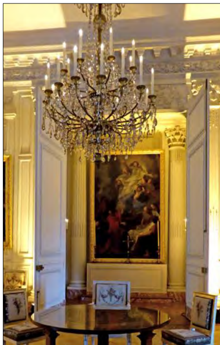
top: Hall of Mirrors below: State Room

So, Thursday was to explore the Mesdames Apartments, the gardens with their parterres, fountains; Apollos fountain is wonderful with the horses coming out of the water, the canal and groves. There's even an outside Ballroom. Then on to the Trianons (Grand et Petit) and Marie Antoinette's Estate. Most girls make do with a dolls house – she had a whole estate, life sized! It was about 3.30pm when we came out of the gardens and the queues were even longer than they had been in the morning, so all the horror stories we'd heard about the queues are true. So, if you're planning a trip to Versailles – try a Wednesday and use the side gate.