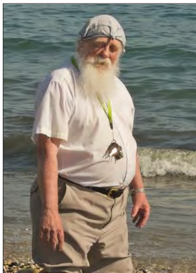
top: the photographers selfie