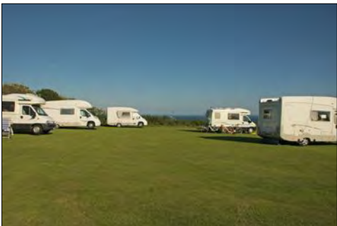
below: Gulval cricket club