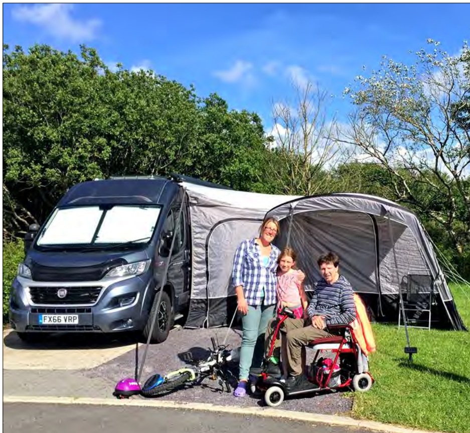
Family picture at Haven Holiday Camp, Greenaces, Black Rock Sands Porthmadog with our new Fiat Ducato Fairford automatic