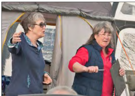
top: the marshalls in action