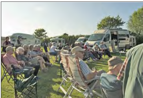
below: the final day party