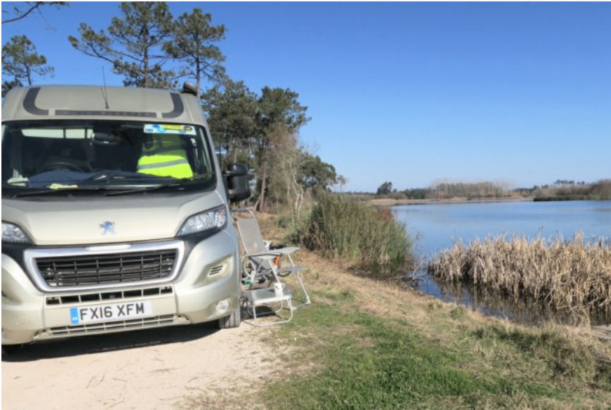
Portuguese Camping. see article

A Company Limited by Guarantee Registered Office: Orchard Works, Willersey, Nr. Broadway Worcs. WR12 7QF. Registered No: 4616969