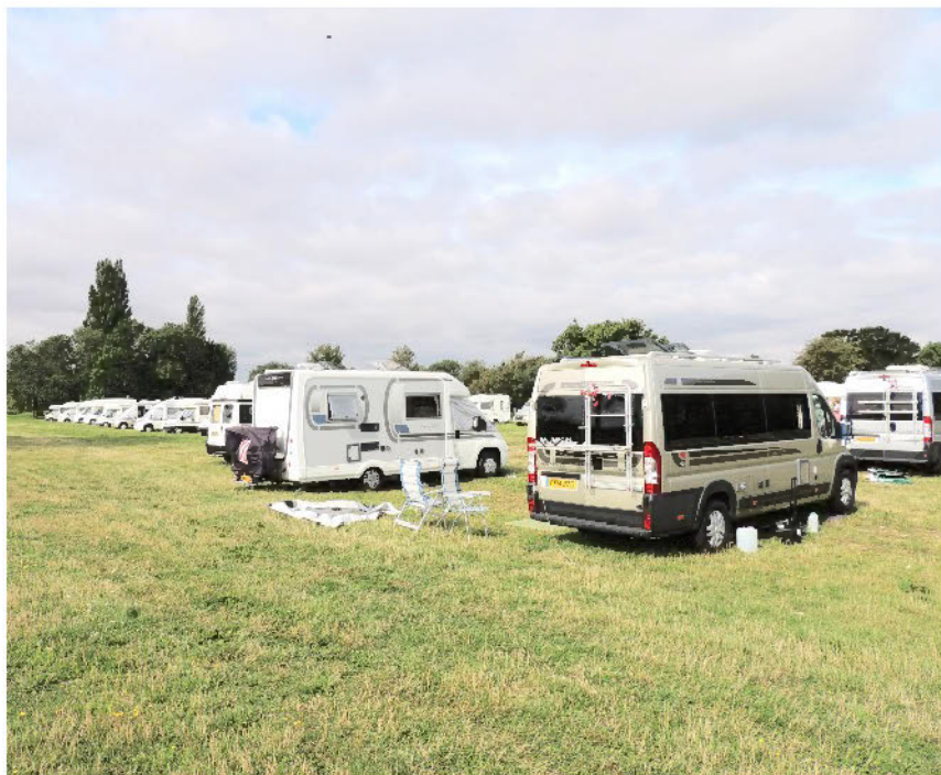
Rally Field at St Ives

A Company Limited by Guarantee Registered Office: Orchard Works, Willersey, Nr. Broadway Worcs. WR12 7QF. Registered No: 4616969