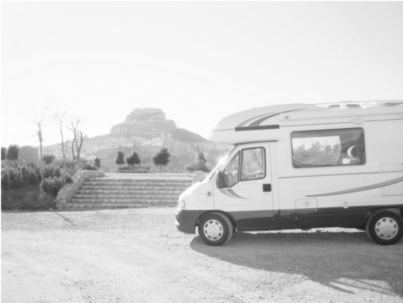
Spring in Spain

A Company Limited by Guarantee Registered Office: Orchard Works, Willersey, Nr. Broadway Worcs. WR12 7QF. Registered No: 4616969