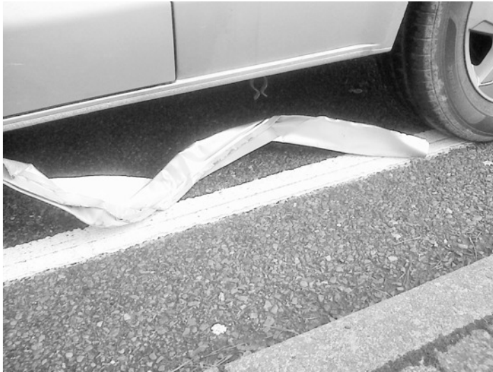
see February newsletter item

A Company Limited by Guarantee Registered Office: Orchard Works, Willersey, Nr. Broadway Worcs. WR12 7QF. Registered No: 4616969