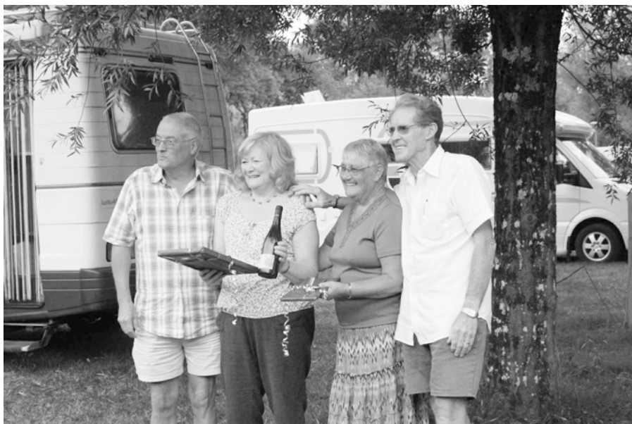
Azay Rally marshals