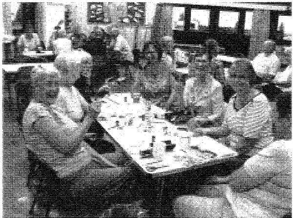
Ladies Craft Evening