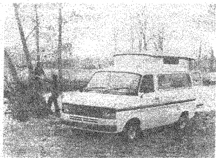
Ford Auto-Sleeper Model F585

The Ford Auto-Sleeper, which is part of the official Ford motor caravan range, is a 4-berth luxury motor caravan and is fitted with a 1.8-litre petrol engine; solid construction elevating roof; 2 single or 1 double bed; 2 roof bunks; 4 front facing seats; 16 gal. water tank; insulation; full ventilation. Optional equipment includes: 2-litre engine; cab roof tank; chemical toilet; fly screens; Electrolux gas electric refrigerator; diesel engine; automatic transmission; overdrive.